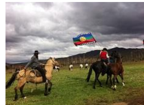
The Pewenche people of the Chilean Andes

For many, mountains evoke powerful emotions with their breathtaking landscapes that inspire wonder. Mountains cover nearly 22 percent of the world's land surface and are home to 13 percent of the global population. They serve as water towers to the world, providing for the freshwater needs of