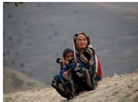
#MountainsMatter photo contest winner

The European Commission has launched a public stakeholder consultation on the interim evaluation of Horizon 2020 , a European Union Research and Innovation programme with nearly €80 billion of funding available for 2014–2020. The Mountain Research Initiative (MRI) calls on