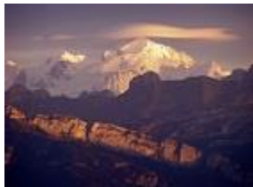
Highlighting mountains in EU's Horizon 2020

The European Commission has launched a public stakeholder consultation on the interim evaluation of Horizon 2020 , a European Union Research and Innovation programme with nearly €80 billion of funding available for 2014–2020. The Mountain Research Initiative (MRI) calls on